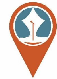
Arts & Entertainment