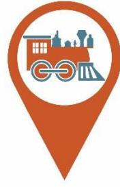
History & Heritage